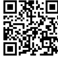
CAREER WEEK WEBSITE

The Career Week platform provides students with the opportunity to learn more about exciting careers relating to HSFI's F.A.B. majors: Fashion Design, Fashion Marketing & Management, Graphics & Illustration/ Photography, and Visual Merchandising. Featured you will find engaging interviews with industry leaders conducted by students and staff of our HSFI community.